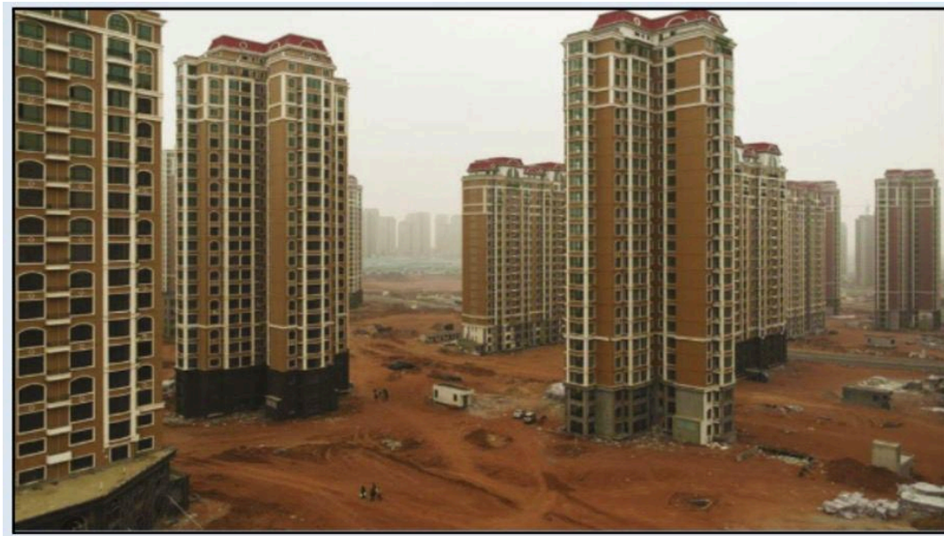
Fig 2. Ghost Towns

There is a disillusionment with how DAO-like a community today can be. But there is an optimism that the community can contribute to redefining what it means to be a DAO. While communities here do not identify with DAOs and might not be perceived as DAOs when adopting a strict technical definition of on-chain governance, there is still much to learn about how the culture can contribute to the broader DAO discourse from the unique governance practices which emerge.